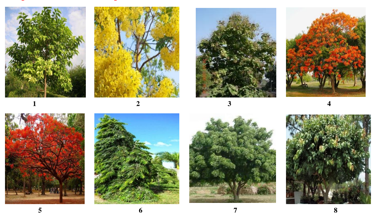
Anthocephalus indicus, Cassia fistula, Shorea robusta, , Delonix regia , Butea monosperma kuntze, Saraca asoca, Azadirachta indica, Ficus religiosa